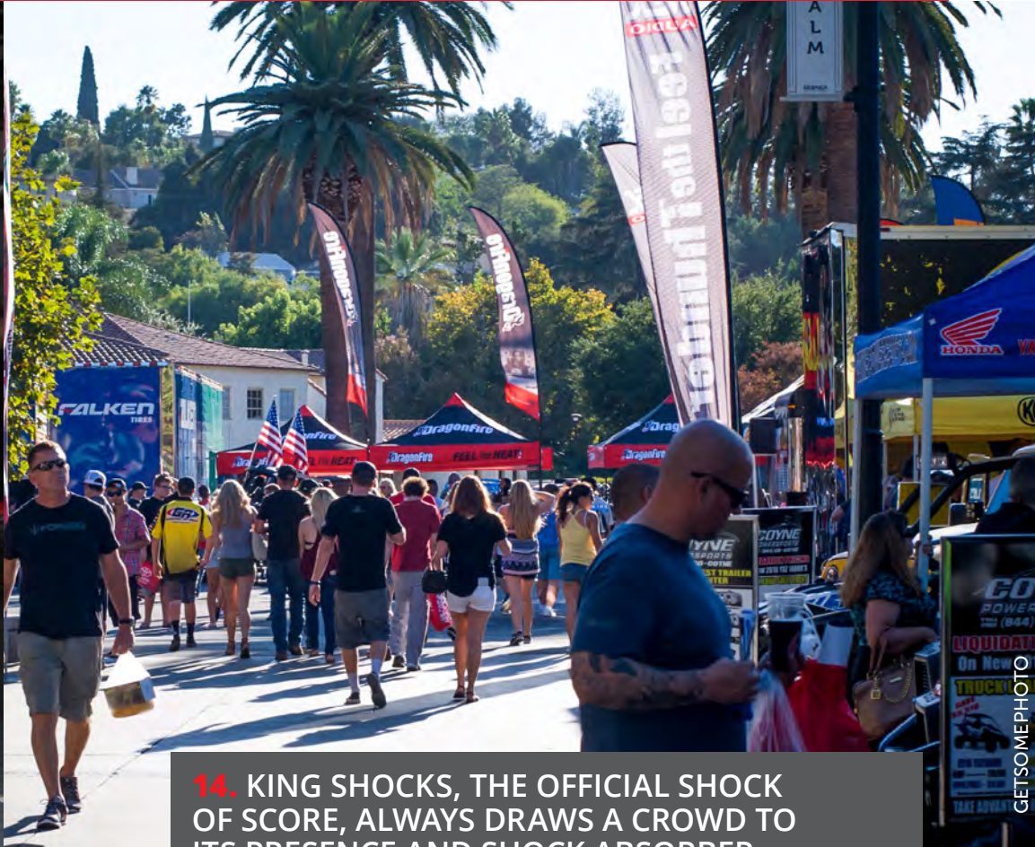
14. KING SHOCKS, THE OFFICIAL SHOCK OF SCORE, ALWAYS DRAWS A CROWD TO ITS PRESENCE AND SHOCK ABSORBER TECHNOLOGIES, AT ANY OFF-ROAD SHOW.