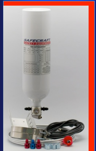
Model AS5 Electric