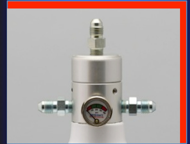
Model LT Pneumatic Head