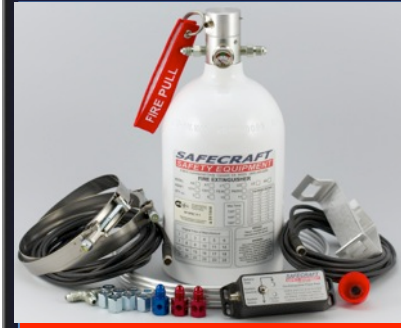
Model LT5 Electric / Manual Compact