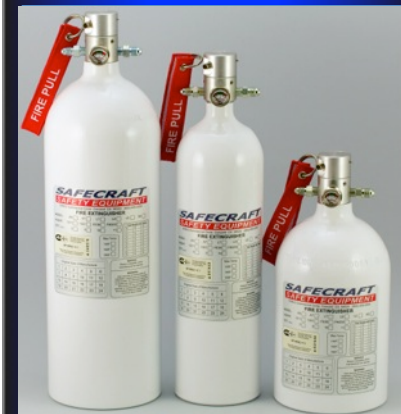
Model LT Electric / Manual Family