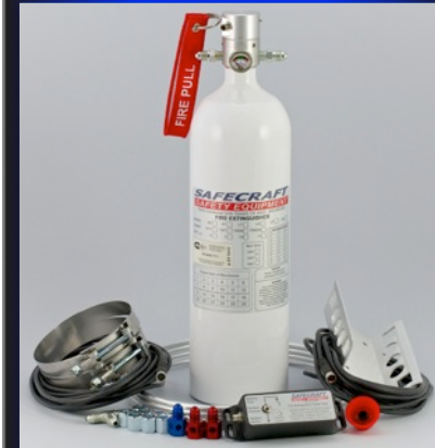
Model LT5 Electric / Manual Slimline