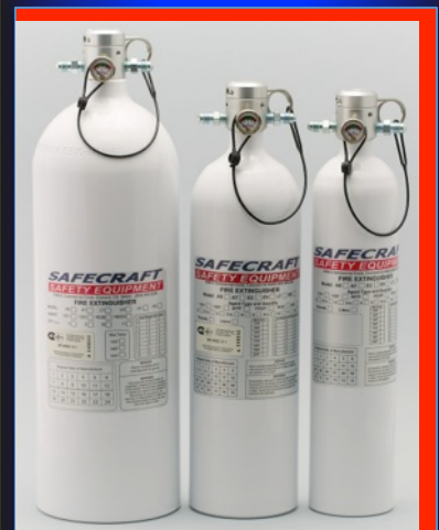
Model LT Family