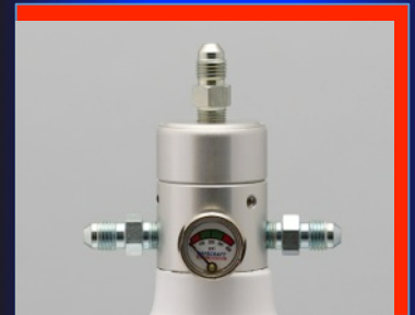
Model LT Pneumatic Head